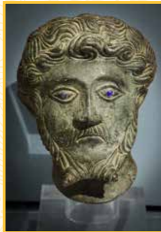
Cast-bronze head of Emperor Marcus Aurelius